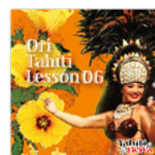
Ori Tahiti Lesson 06