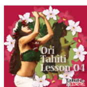
Ori Tahiti Lesson 04