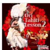
Ori Tahiti Lesson 02