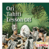
Ori Tahiti Lesson 08