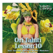
Ori Tahiti Lesson 10