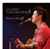
O TAHITI TO 'U 'AI 'A HERE (Maruarui ATENI)