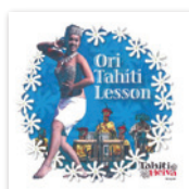
Ori Tahiti Lesson

A collection of short selections of drumming for Tahitian dance practice