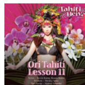
Ori Tahiti Lesson 11