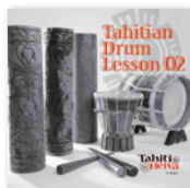
Tahitian Drum Lesson vol. 2