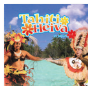
Tahiti Heiva in Japan vol. 1

Original albums of recordings done by artists invited over from Tahiti.