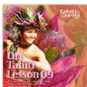
Ori Tahiti Lesson 09