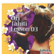
Ori Tahiti Lesson 03