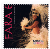
FARA E (Tahiti Heiva in Japan vol. 2)