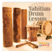
Tahitian Drum Lesson vol. 1

Instructive CDs for Tahitian drum practice (recordings done locally by artists invited from Tahiti).