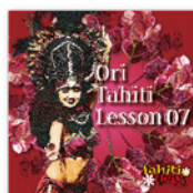
Ori Tahiti Lesson 07