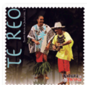
TE REO (Tahiti Heiva in Japan vol. 3)